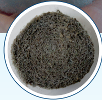
Cross-sectional area FIBALON® (used)

In our brand-new FIBALON®rope, we use also our innovative polymer fiber filter material . Optimized fiber combinations and process engineering innovations enable an incomparably high selectivity of 8 microns for FIBALON®rope .